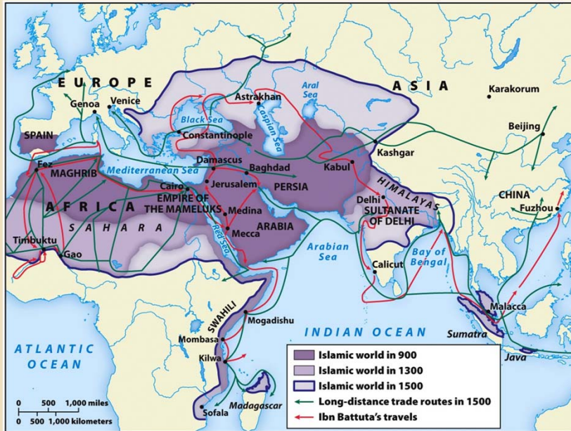
Map 9.3 The Growing World of Islam, 900–1500 Chapter 9, Ways of the World: A Brief Global History , Second Edition and Ways of the World: A Brief Global History with Sources , Second Edition Copyright © 2013 by Bedford/St. Martin's Page 299 (page 429, With Sources)