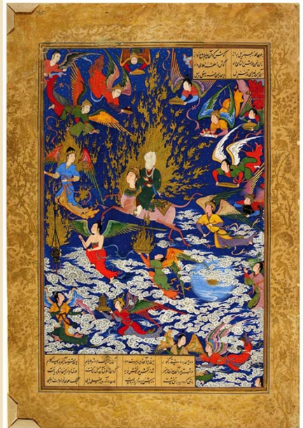
Visual Source 9.2 The Night Journey of Muhammad Chapter 9, Ways of the World: A Brief Global History with Sources, Second Edition Copyright © 2013 by Bedford/St. Martin's Page 457