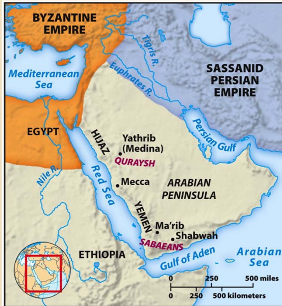
Map 9.1 Arabia at the Time of Muhammad Chapter 9, Ways of the World: A Brief Global History , Second Edition and Ways of the World: A Brief Global History with Sources , Second Edition Copyright © 2013 by Bedford/St. Martin's Page 284 (page 414, With Sources)