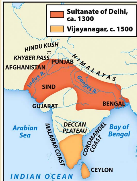
Map 9.4 The Sultanate of Delhi Chapter 9, Ways of the World: A Brief Global History , Second Edition and Ways of the World: A Brief Global History with Sources , Second Edition Copyright © 2013 by Bedford/St. Martin's Page 300 (page 430, With Sources)