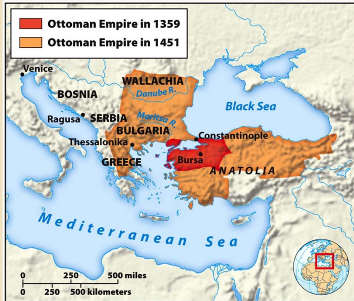
Map 9.5 The Ottoman Empire by the Mid-fifteenth Century Chapter 9, Ways of the World: A Brief Global History , Second Edition and Ways of the World: A Brief Global History with Sources , Second Edition Copyright © 2013 by Bedford/St. Martin's Page 301 (page 431, With Sources)