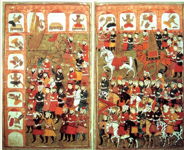
Visual Source 9.4 The Destruction of the Idols Bibliothèque nationale de France Chapter 9, Ways of the World: A Brief Global History with Sources , Second Edition Copyright © 2013 by Bedford/St. Martin's Page 460