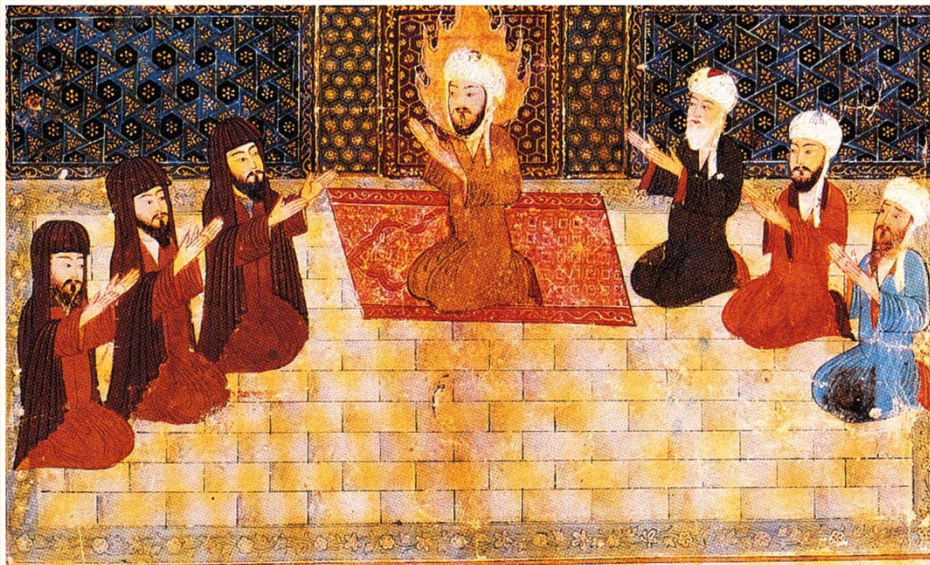
Muslims, Jews, and Christians Bibliothèque nationale de France Chapter 9, Ways of the World: A Brief Global History, Second Edition and Ways of the World: A Brief Global History with Sources, Second Edition Copyright © 2013 by Bedford/St. Martin's Page 285 (page 415, With Sources)