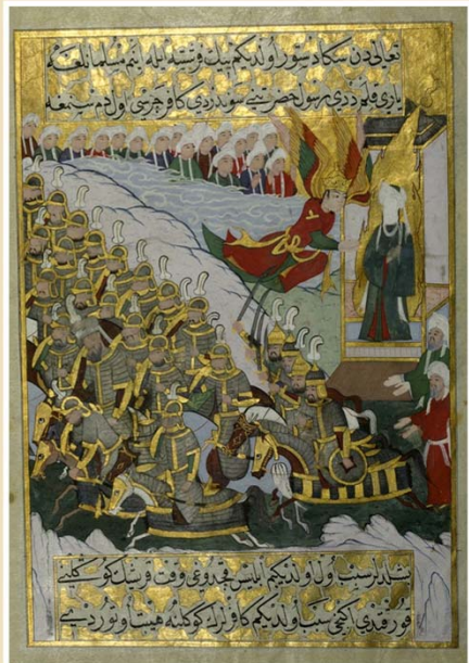
Visual Source 9.3 The Battle at Badr Chapter 9, Ways of the World: A Brief Global History with Sources, Second Edition Copyright © 2013 by Bedford/St. Martin's Page 459