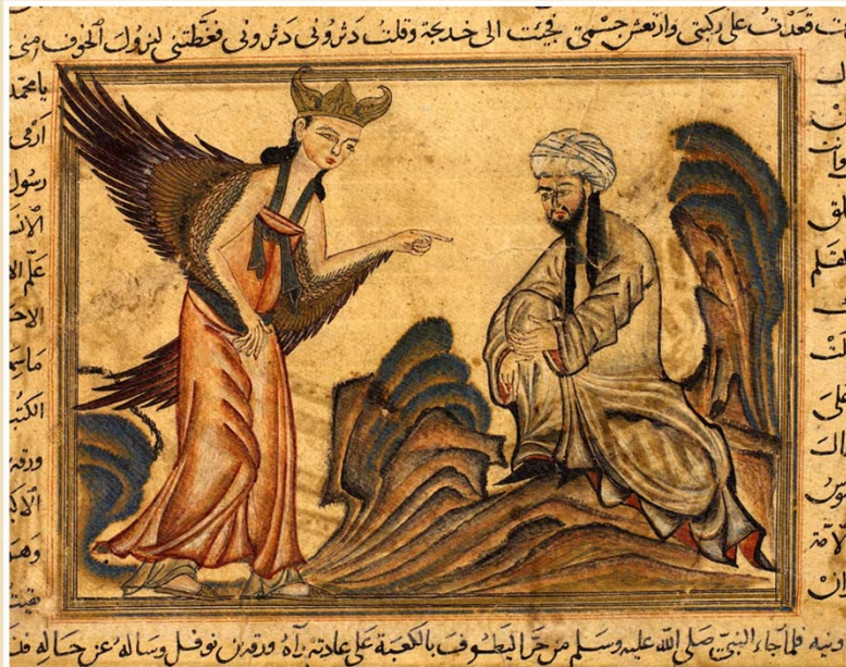
Visual Source 9.1 Muhammad and the Archangel Gabriel Chapter 9, Ways of the World: A Brief Global History with Sources, Second Edition Copyright © 2013 by Bedford/St. Martin's Page 456